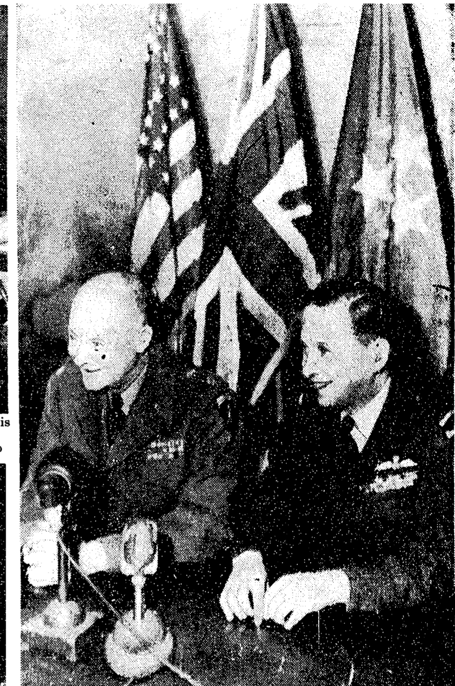
General Eisenhower and Air Chief Marshal Sir Arthur W. Tedder, Deputy Supreme Commander, wear victory smiles as General Eisenhower announces end of war in Europe.