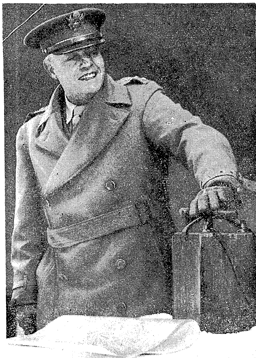
Lieut. Gen. Lucian K. Truscott, American Third Army commander, sets off explosion that reduced factory at Kaufbeuren to ruins.