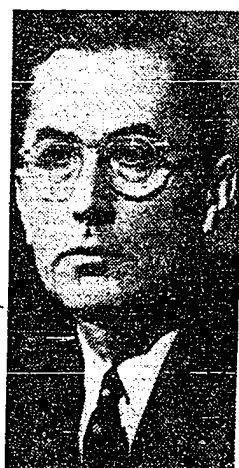
William E. Colby