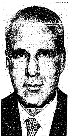
James R. Schlesinger