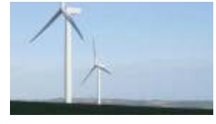
Business profile: Eneco 4:51