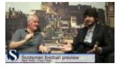
The Scotsman's Scottish football preview 15:55