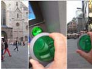
Eagle-eyed tourist in Vienna uncovers ATM skimming scam