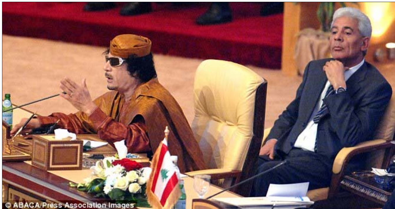
Any promise of special protection for Moussa Koussa, one of Gaddafi's most notorious henchmen, has provoked anger from those who want him put on trial for his alleged crimes