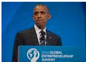
Obama shrugs off his humiliating