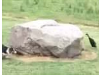
Watch as a duck and dog playfully chase each other