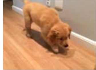
Gotcha! Cute Golden Retriever puppy sneakily pounces on toy