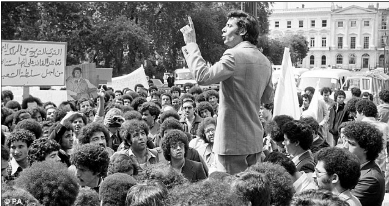
Moussa Koussa addressing pro-Gaddafi supporters outside the Libyan People's Bureau in St James's Square, London in 1980

Geoffrey Robertson QC, the human rights barrister, said Koussa's claim for asylum would be based on his persecution from both the Gaddafi regime and the opposition groups who still viewed him as a 'torturer-in-chief'.