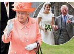
Queen attends 'society wedding of