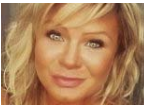
Mother, 42, is killed by police after she