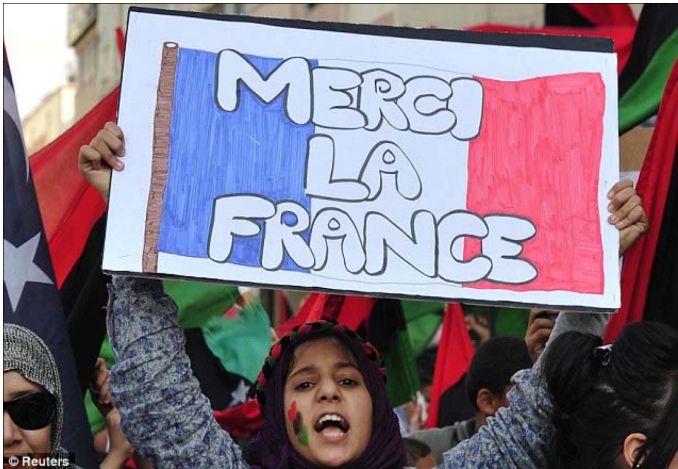
A protester shows a sign during an anti-Gaddafi demonstration in Benghazi on Saturday

Younis, his presence providing a much needed boost to the flagging rebels' morale, smiled and posed for photographs.