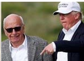
Look who's coming to dinner: Trump