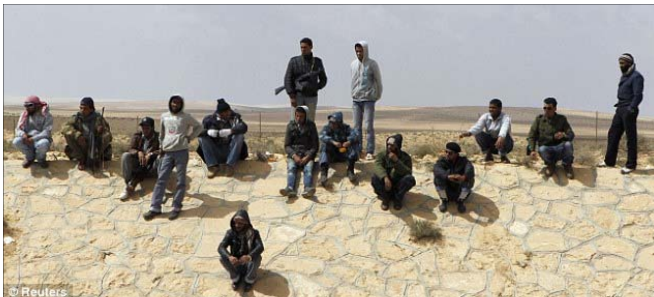
Rebels gather on the front line between exchanges of artillery fire between them and forces loyal to Gaddafi near Brega in eastern Libya on Saturday

A senior aide who accompanied him said yesterday: 'He has been working intensely towards this. He has had to put his trust in the people who have been Gaddafi's closest supporters for years.