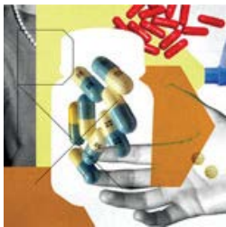
Keeping Blood Pressure in Check