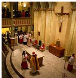
A New Beginning for a Manhattan Church