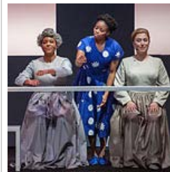
Flowers From the Cotton Fields