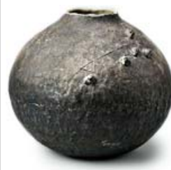
Finally, the Bowl Gets Its Due