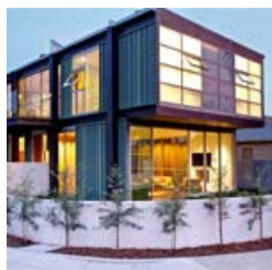
Enter the Lighting Expert