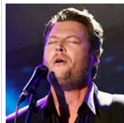
He Speaks Country in a Dialect of His Own