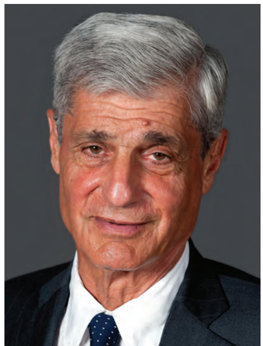
Co-Chairman Robert E. Rubin