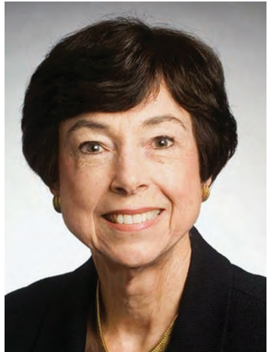
Co-Chairman Carla A. Hills