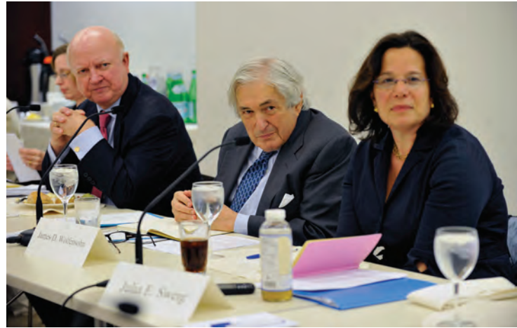
Top left: Turkish president Abdullah Gul hosts CFR's Task Force on Turkey chaired by former secretary of state Madeleine K. Albright and former national security adviser Stephen J. Hadley.