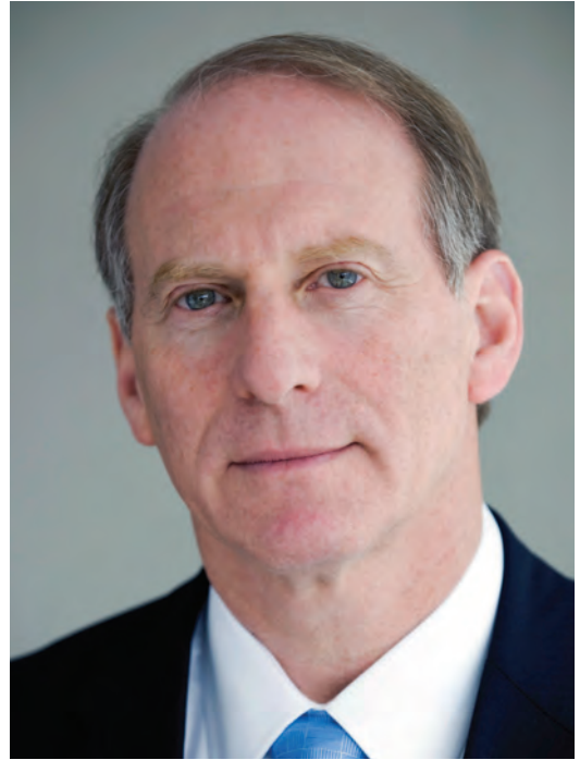
President Richard N. Haass

In response to the ever-shifting information landscape, we are incorporating cutting-edge strategies to produce and distribute content tailored for new constituencies. We are using infographics, chart books, and interactives to visually illustrate complex issues and major economic trends. CFR scholars connect with new and growing audiences on an array of social media platforms through their blogs, Twitter feeds,