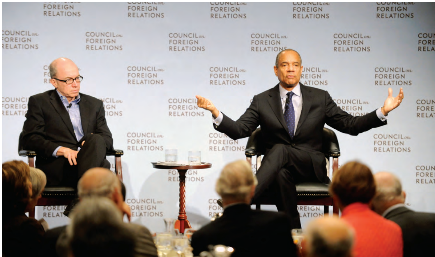
Kenneth I. Chenault, chairman and chief executive officer of American Express, discusses the upheaval in the eurozone, the struggling U.S. economy, and the role of business in foreign policy with the Wall Street Journal's Alan S. Murray.