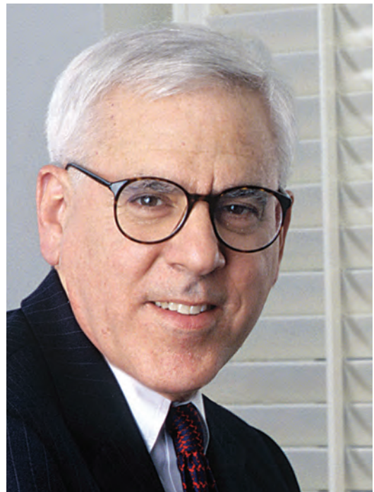
Vice Chairman David M. Rubenstein

Carla A. Hills Robert E. Rubin Co-Chairs of the Board