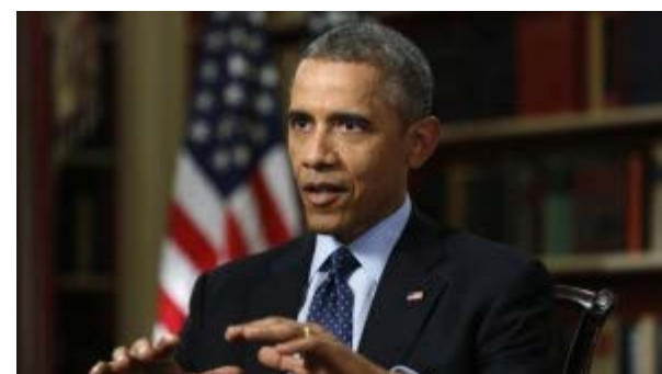
President Obama talks to Reuters