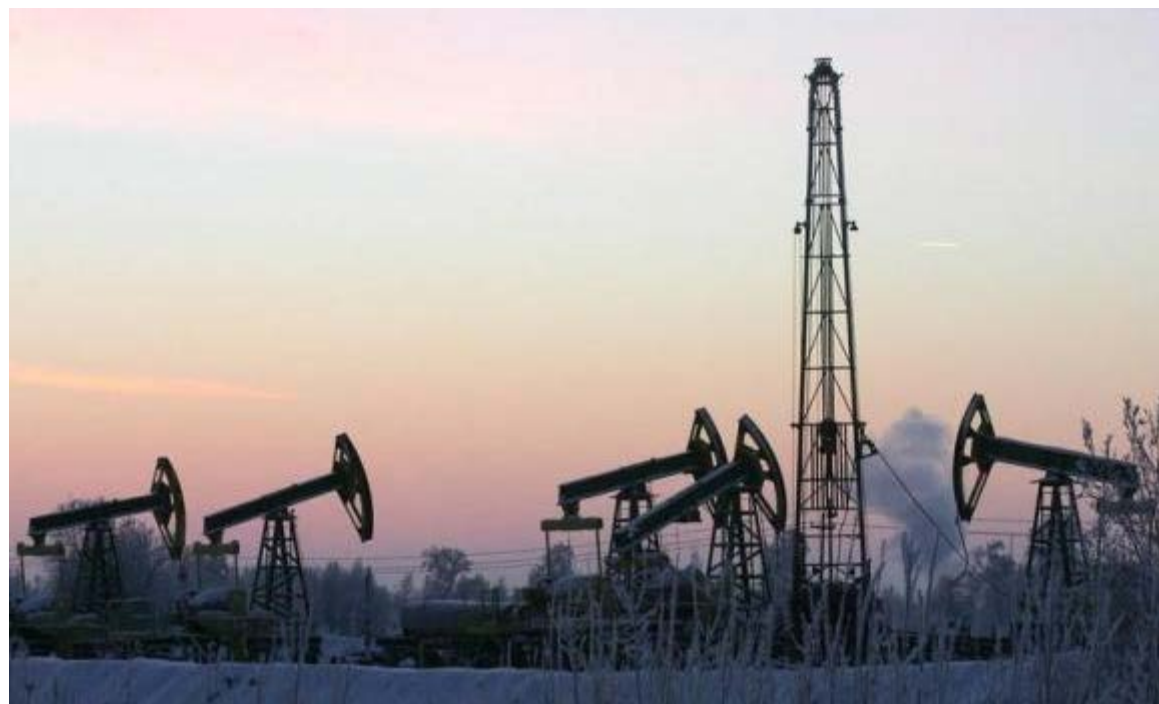
Derricks at Yuganskneftegaz oil processing facility at Mamontovskoye oilfield outside the Siberian town of Nefteyugansk.