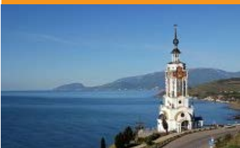
Russia Marks First Anniversary of Crimean