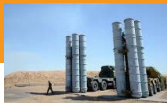
Russia and US Remain Leading Arms Exporters