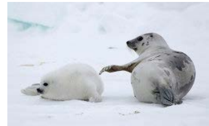
Seal Pup Protection Day: Spare My Life, Do Not Club!

Tags: panic, currency exchange rate, currency, Ukraine