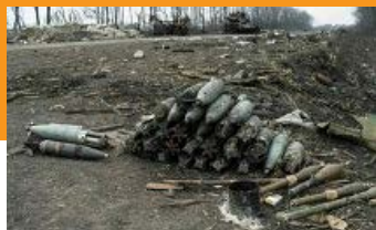
Kiev is Ready to Use 'Unique' Chance to Establish Peace -