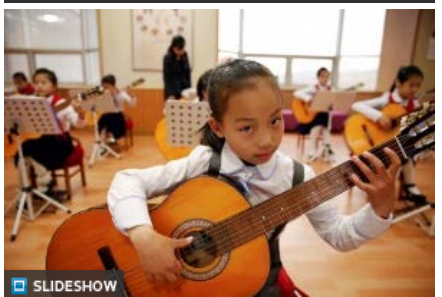
Our top photos from the past week. Full Coverage »