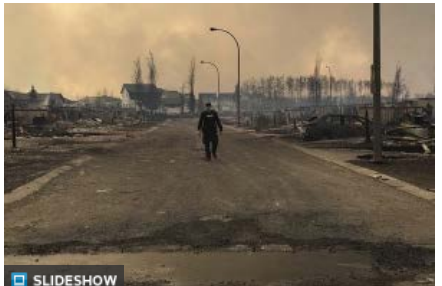
Fire rages unchecked in the heart of Canada's oil sands region as authorities evacuate 80,000 people. Full Coverage »