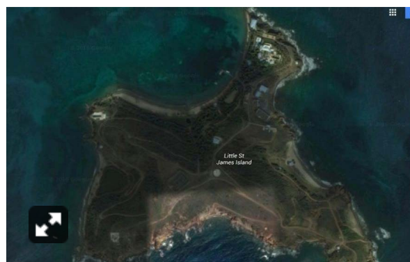
Epstein owns the entire 72-acre island.