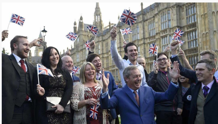
Nigel Farage (front), the leader of the United Kingdom Independence Party (UKIP) reacts with supporters, following the result of the EU referendum, outside the Houses of Parliament in London, Britain June 24, 2016.

The choice could have disastrous consequences for the British economy and ripple across the globe.