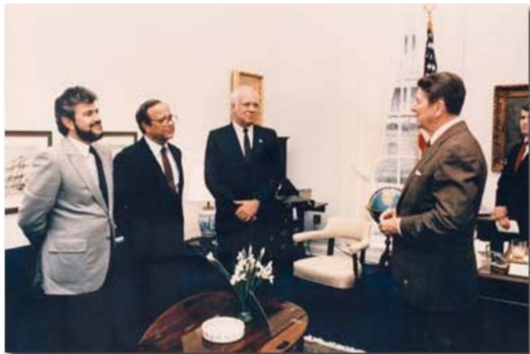
President Reagan meets with Contra leaders in the Oval Office. Oliver North is at far right. When this photo was officially released North's image was cut out.

home | about | documents | news | publications | FOIA | research | internships | search | donate | mailing list