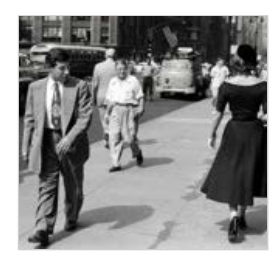
What We Wore: Decades of Dressing in New York