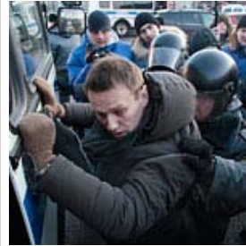
Putin Nemesis Stays Defiant Ahead of Trial

Open the Border and Help the Bottom Line? Room for Debate examines the relationship between increased immigration and economic growth.