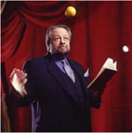
Keeping His Secrets Well Up His Sleeve