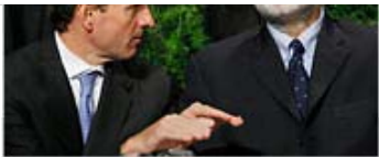
Timeline: Investigations and Enforcement in the Financial Crisis