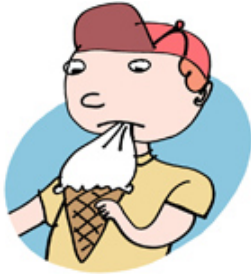
Ice Cream's Identity Crisis