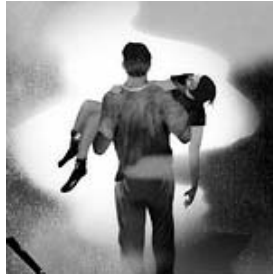
Dennis Lehane: Messing With the Wrong City