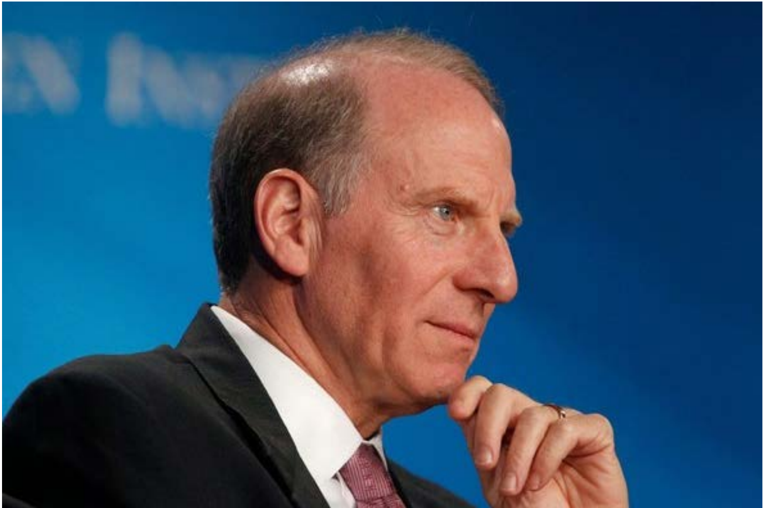
Richard N. Haass, president of the Council on Foreign Relations, in 2012.

Donald J. Trump, who again declined on Thursday morning to say whom he talks to about foreign affairs, held a private briefing last summer with Richard N. Haass, the president of the Council on Foreign Relations, a spokeswoman for Mr. Haass said Thursday.