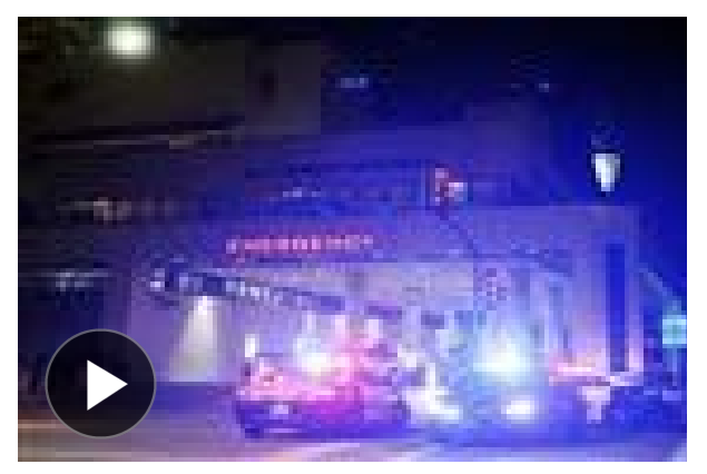
ARTS & ENTERTAINMENT How the Dallas Shooting Attack Unfolded

Plane Makers Automate to Meet Surging Demand •