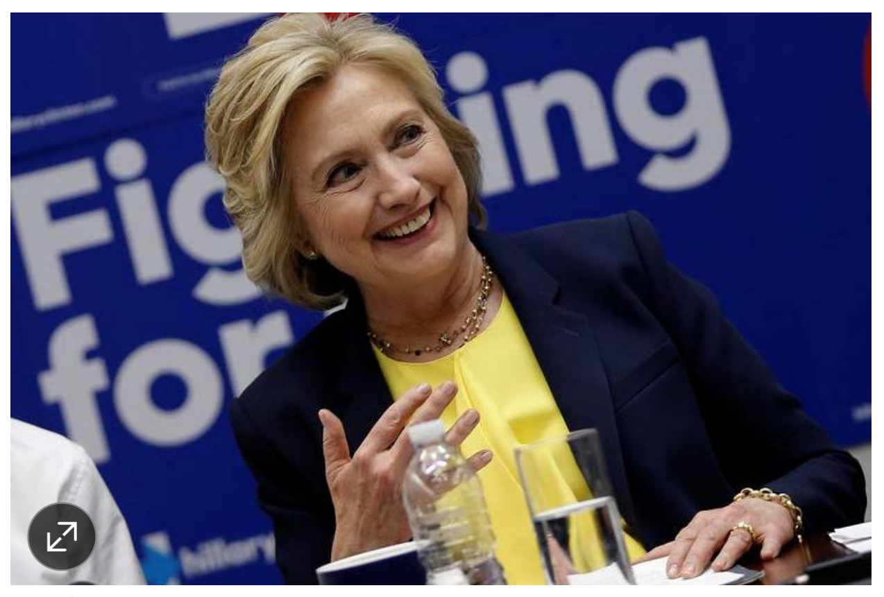
Hillary Clinton makes remarks during a meeting in Brooklyn on Thursday.