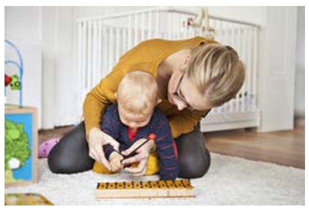
THE SATURDAY ESSAY