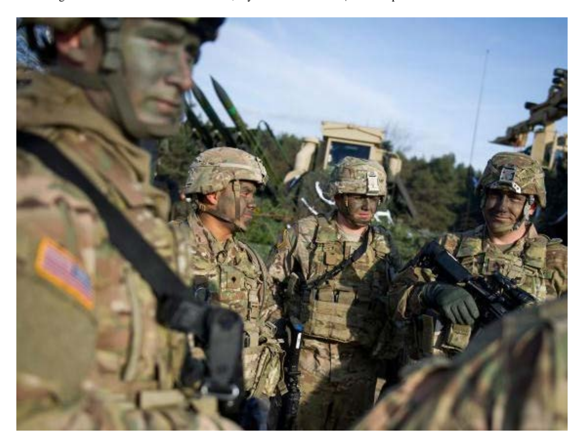
Nato has increased the troops deployed along its eastern flank

But almost 70 years on, the alliance's focus has expanded to hybrid warfare, including cyber attacks and hacking, which has sparked the creation of a dedicated Nato online defence force.