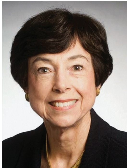
Co-Chairman Carla A. Hills