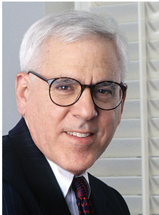
Vice Chairman David M. Rubenstein

Carla A. Hills Robert E. Rubin Co-Chairs of the Board