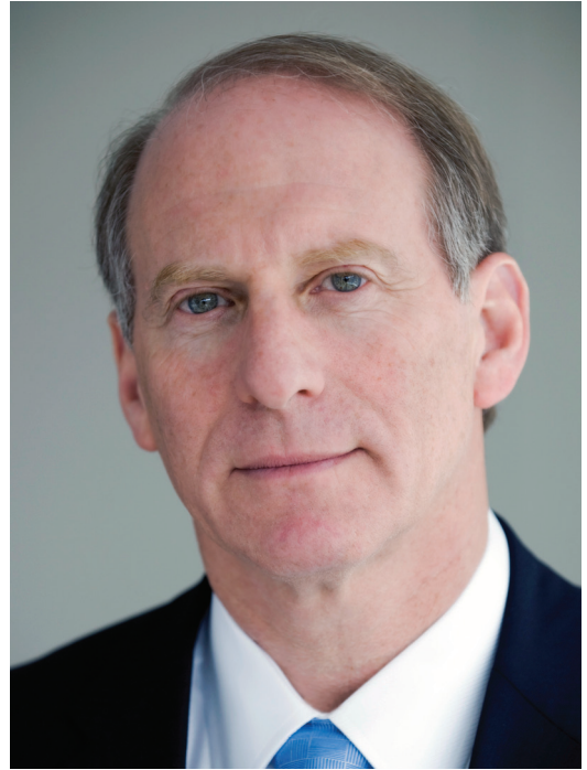
President Richard N. Haass

In response to the ever-shifting information landscape, we are incorporating cutting-edge strategies to produce and distribute content tailored for new constituencies. We are using infographics, chart books, and interactives to visually illustrate complex issues and major economic trends. CFR scholars connect with new and growing audiences on an array of social media platforms through their blogs, Twitter feeds,