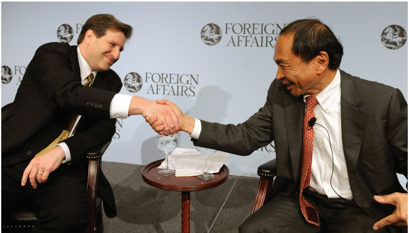
Foreign Affairs Editor Gideon Rose with renowned political scientist Francis Fukuyama at the Foreign Affairs LIVE event “The Future of History.”

3.2 million unique visitors and 11 million page views. More than 175,000 readers follow Foreign Affairs on social media (including Twitter and Facebook), more than 100,000 subscribe to our free weekly newsletter, and our Foreign Affairs videos on YouTube have been viewed more than 150,000 times. We will continue to embrace the digital revolution in the year to come and are currently developing an app for the iPad.